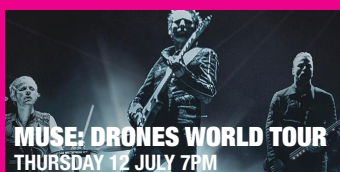
MUSE: DRONES WORLD TOUR THURSDAY 12 JULY 7PM