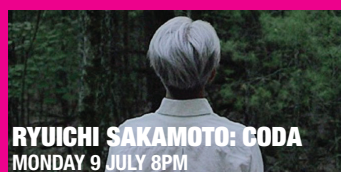
RYUICHI SAKAMOTO: CODA MONDAY 9 JULY 8PM