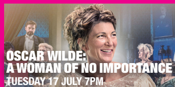
OSCAR WILDE: A WOMAN OF NO IMPORTANCE TUESDAY 17 JULY 7PM