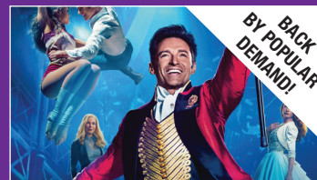
THE GREATEST SHOWMAN (PG)