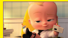
THE BOSS BABY (U) 7 JULY