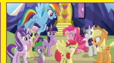
MY LITTLE PONY (U) 14 JULY