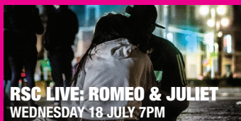
RSC LIVE: ROMEO & JULIET WEDNESDAY 18 JULY 7PM