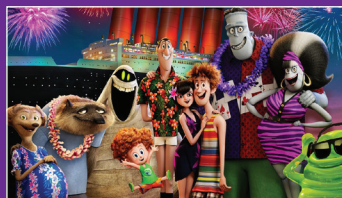
HOTEL TRANSYLVANIA 3: A MONSTER VACATION (TBC)